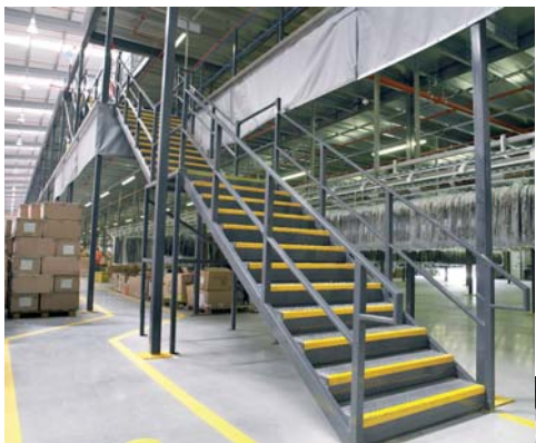
Part M Staircase

Installation is carried out through a network of specialist, locally based teams experienced and qualified in the handling and erection of mezzanine floors. All team members operate to appropriate site safety protocols approved and monitored by our appointed health and safety consultant. Avanta has even developed its enhanced Netsafe system of safety procedures to address the unique risks associated with the installation of complex structures within existing buildings. Operatives are fully insured and trained to operate required equipment and are certified to nationally approved standards. All teams have completed the CSCS (Construction Skills Certification Scheme) and, where appropriate, are also SEIRS (Storage Equipment Installers Registration Scheme) trained.