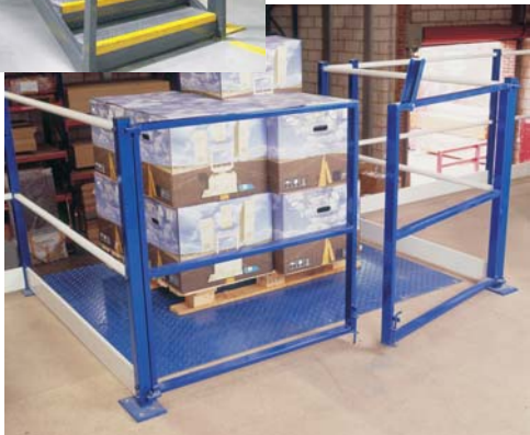
Pallet Access Gate