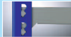
Blue Uprights (GB) with Light Grey beams