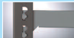
Dark Grey Uprights (GX) with Light Grey beams