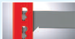
Red Uprights (RD) with Light Grey beams