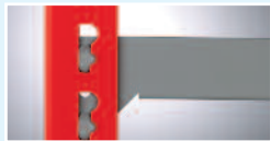
Red Uprights (RD) with Light Grey beams