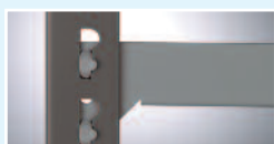
Dark Grey Uprights (GX) with Light Grey beams