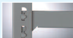
Light Grey Uprights (GU) with Light Grey beams