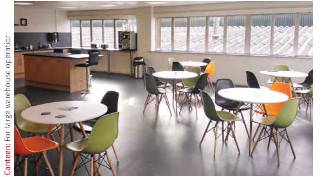
Canteen: For large warehouse operation.