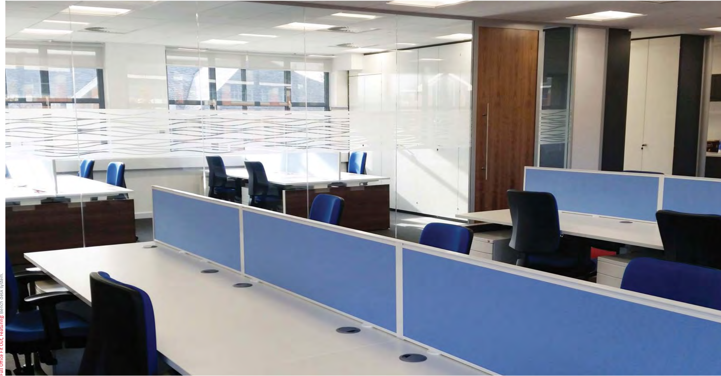
Full Office Fit Out, Featuring: Bench desk system.

For more detailed information please visit: https://www.avantauk.com/office-partitions/