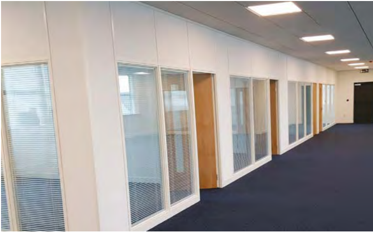
Solid Office Partitions: With glazing and blinds.