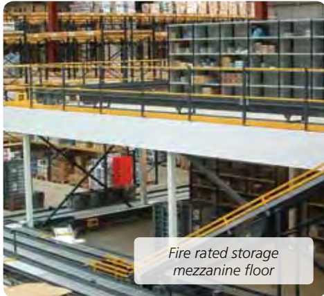
Fire rated storage mezzanine floor