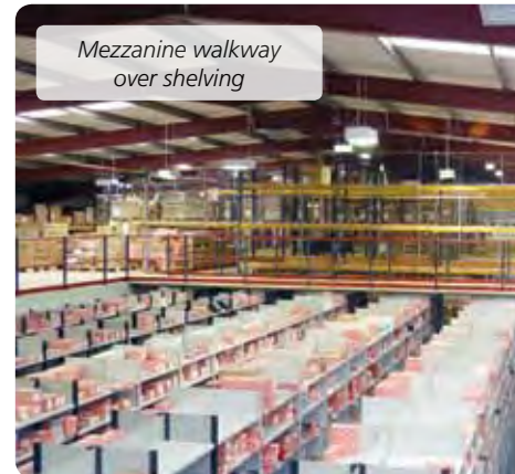
Mezzanine walkway over shelving