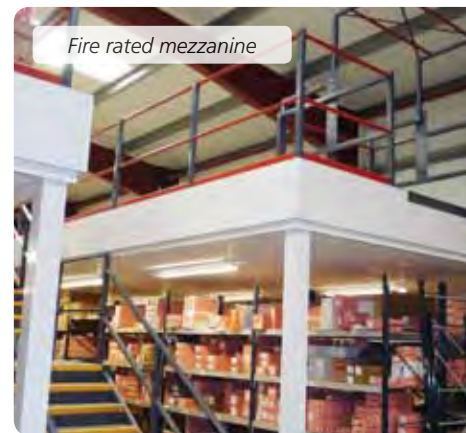
Fire rated mezzanine