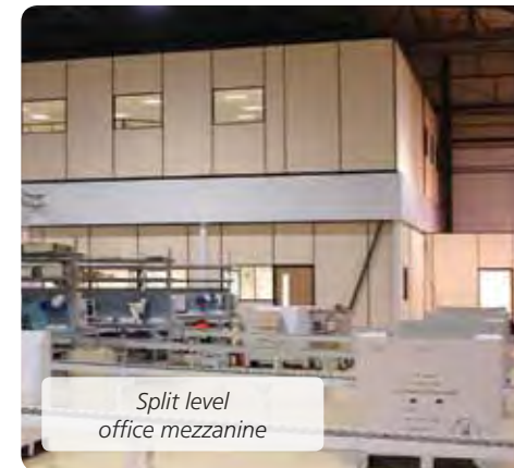
Split level office mezzanine