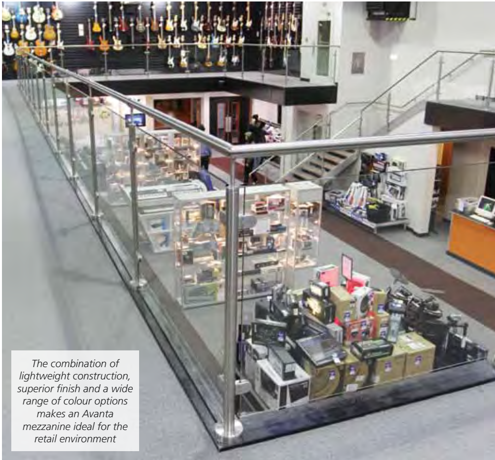
The combination of lightweight construction, superior finish and a wide range of colour options makes an Avanta mezzanine ideal for the retail environment