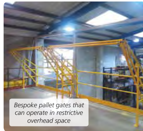
Bespoke pallet gates that can operate in restrictive overhead space