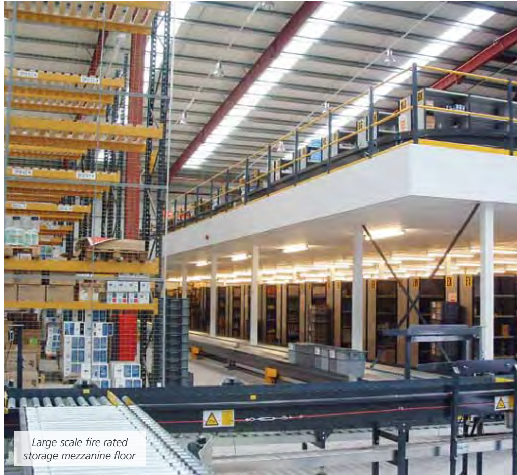
Large scale fire rated storage mezzanine floor