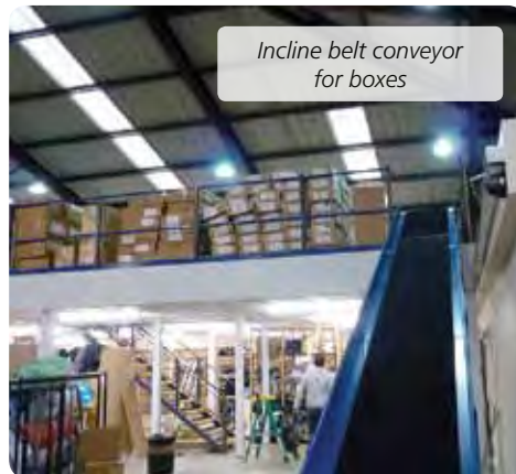
Incline belt conveyor for boxes

We have many years experience in providing large and small businesses with innovative mezzanine floor solutions to their storage and space requirements and, with a network of installation teams throughout the UK, we are able to respond quickly to your needs.