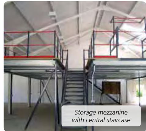
Storage mezzanine with central staircase

Mezzanine floors are future proof by being adaptable and extendable which means your premises can adapt as your business grows - without the need for costly relocation.