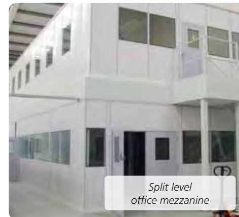
Split level office mezzanine