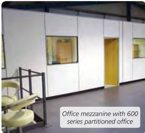
Office mezzanine with 600 series partitioned office