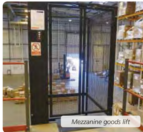
Mezzanine goods lift