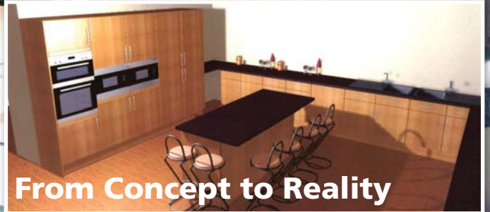
From Concept to Reality