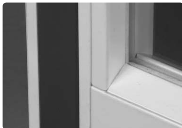
Single or double glazing is available with or without integral blinds.