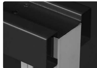
Heavy duty top capping adjustable for height variance and used for tall multi-tier requirements.