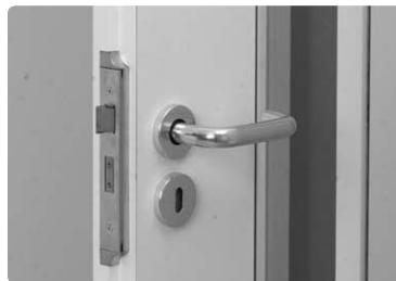
Lock and handle units are integrated;