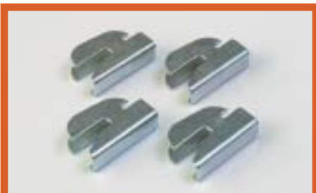
Shelf clip included with all shelves