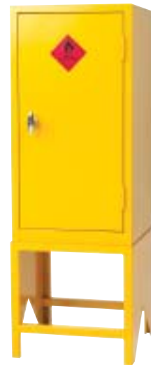
88F944 Cabinet with 88FFS2 Floor stand £223.52