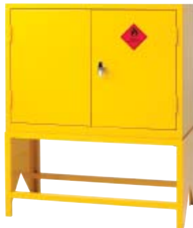
88F794 Cabinet with 88FFS3 Floor stand £215.16