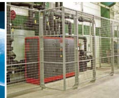
▶ You can use both Caelum UR350 and UX450 to create dividing walls.