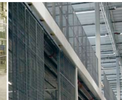
▶ For mezzanine floors, using Caelum UX450 provides added security.