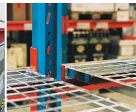
▲ Four loading capacities are available as standard: 125, 250, 500 and 1000 kg; other load capacities are available upon request.