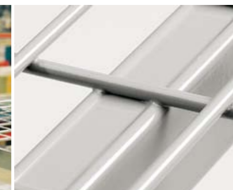
▲ The unique horizontal profile tube gives the panels added strength between wires.