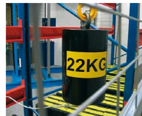
▲ Troax test facility in Hillerstorp, Sweden.

The Musca system is designed to suit your specific requirements. Choose between Musca UR300, UR325 and UR350 panels to create secure storage in a variety of applications, including enclosures and wall division for aerosols, cosmetics, tobacco, liquor, electronic components, pharmaceuticals and other high-value goods.