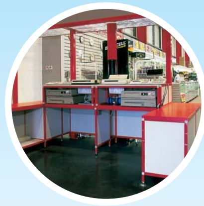
ANGLE AND SQUARE TUBE CONSTRUCTION SYSTEMS