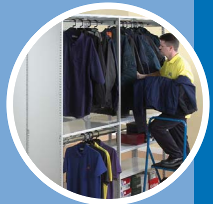
The easy interchangeability of accessories enables the user to tailor storage needs to meet his requirements