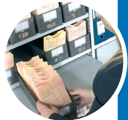
Lloyd George medical files are easily accommodated, offering easy access.