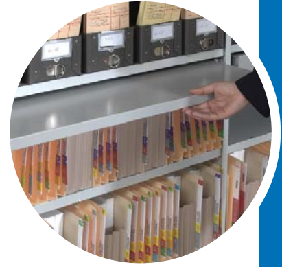
Pull-out reference shelves offer working space without obstructing walkways.

◀ Stormor Shelving is ideal for high density mobile shelving, making it the solution for commercial environments where space and costs are at a premium.