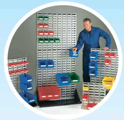
SMALL PARTS STORAGE