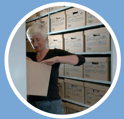
Stormor shelving using Mono inner frames with Duo outer frames offers economy with clean lines.