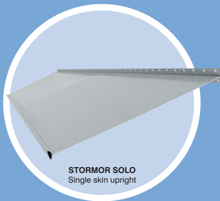
STORMOR SOLO Single skin upright