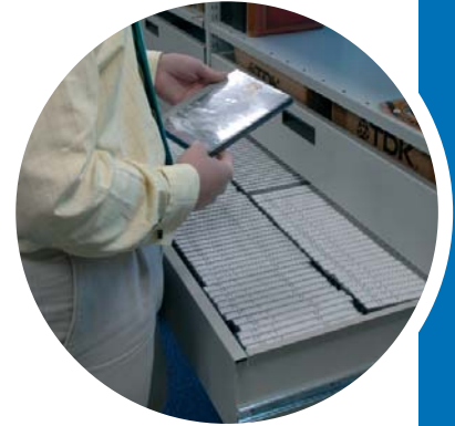
Pull-out drawers offer easy to access storage for CD's and DVD's.