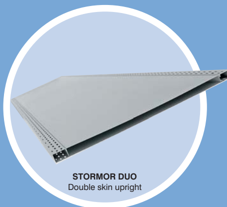
STORMOR DUO Double skin upright