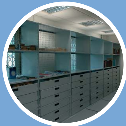
Stormor shelving helps create a more tidier and efficient stock storage solution