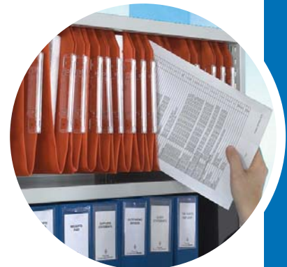
The design of the standard open shelf allows lateral files to be hung underneath, saving the cost of separate filing cradles.