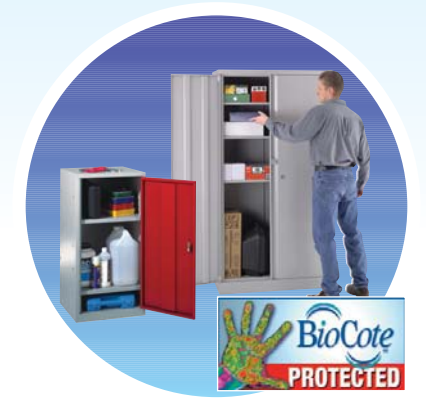
COMMERCIAL AND WORKPLACE EQUIPMENT