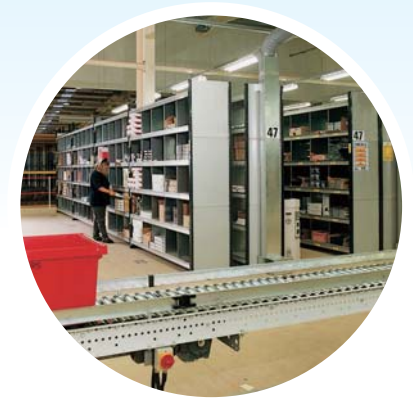
HEAVY DUTY SHELVING