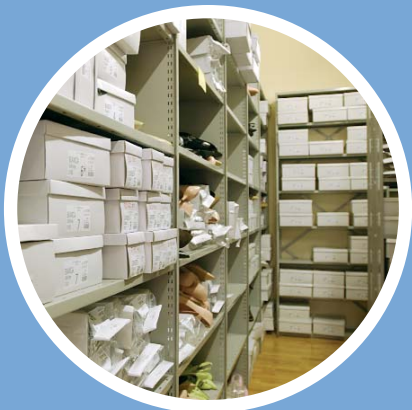
The easily adjustable shelves offer great flexibility to change shelf configuration to match Retail stock requirements