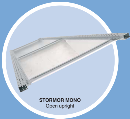
STORMOR MONO Open upright