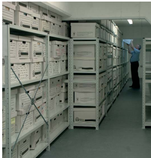
For large high-rise or multi-tier filling and archive installations Stormor's slim profile shelves can be used with our proven Euro-Shelving system to maximise available space.