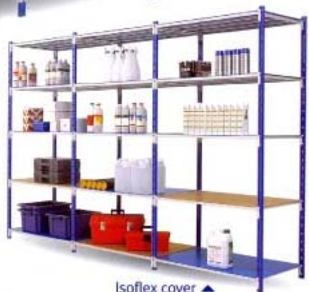
Isoflex cover ▲