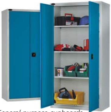
General purpose cupboards