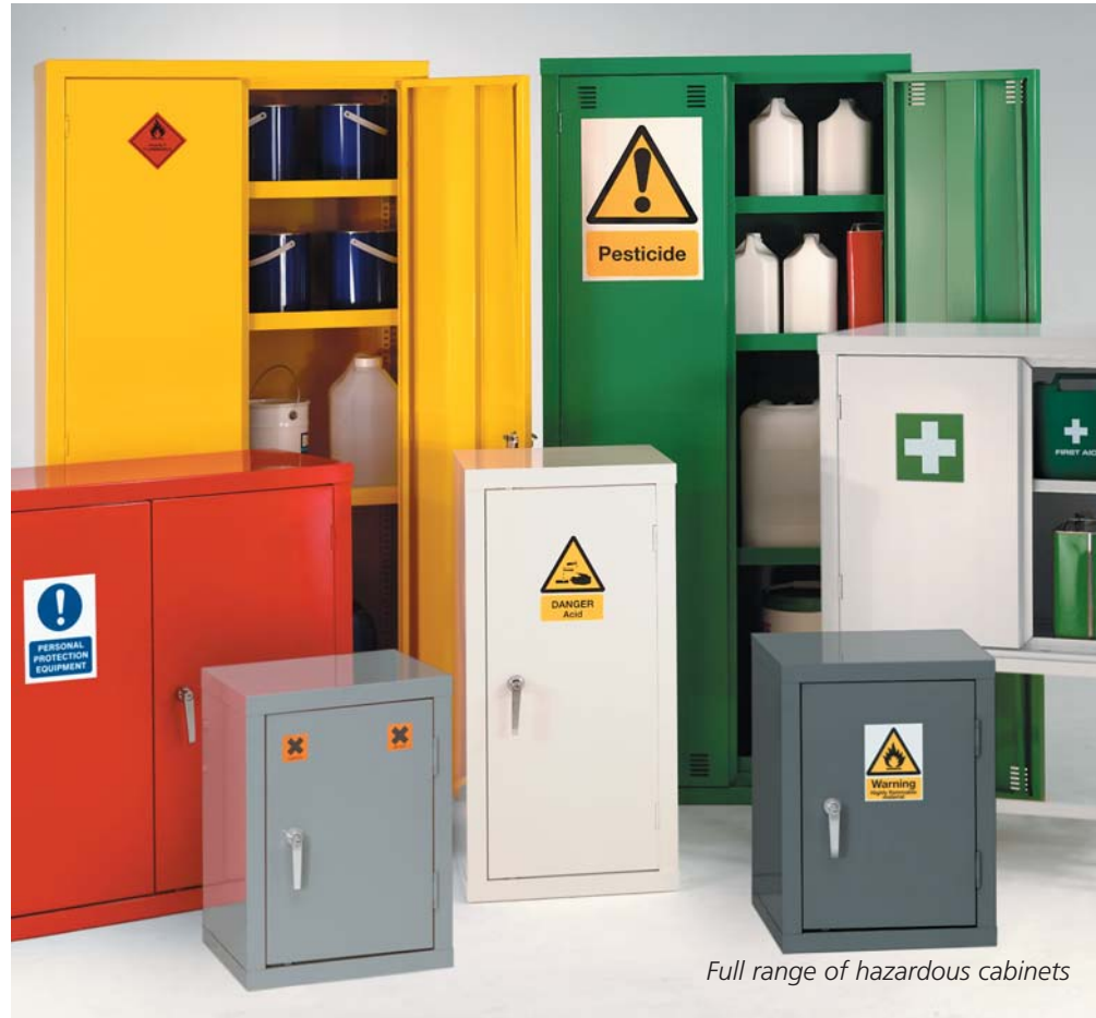
Full range of hazardous cabinets