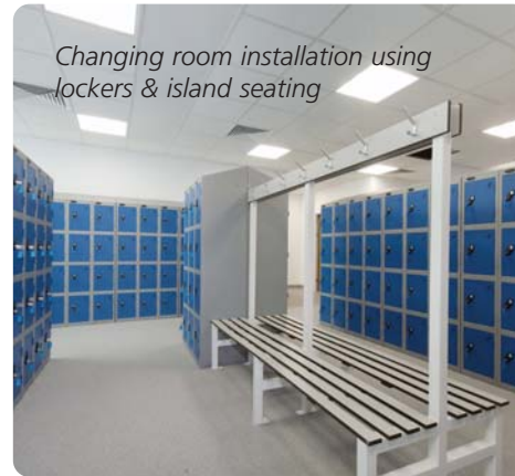
Changing room installation using lockers & island seating

Our Locker systems are manufactured to the highest standards using quality components and are of a robust construction with a durable attractive finish. All mild steel lockers are finished in hygienic hard wearing anti-bacterial powder coat.