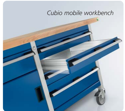
Cubio mobile workbench

This includes, The Bott Cubio and Verso ranges of industrial workplace, office & workshop storage equipment including drawer cabinets, storage cupboards, workbenches and chairs, mobile storage, & CNC systems.