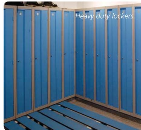
Heavy duty lockers

Combining robust design with a heavy gauge double skin door to guard against leverage and impact, Stronghold lockers are hard to beat when it comes to long lasting security. The heavy duty 5 knuckle hinge is welded to the door, but riveted to the frame to allow for easy replacement.