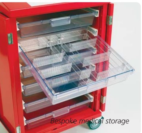
Bespoke medical storage

We offer a range of Industrial seating for all applications inc. laboratories, healthcare, electronics and production.