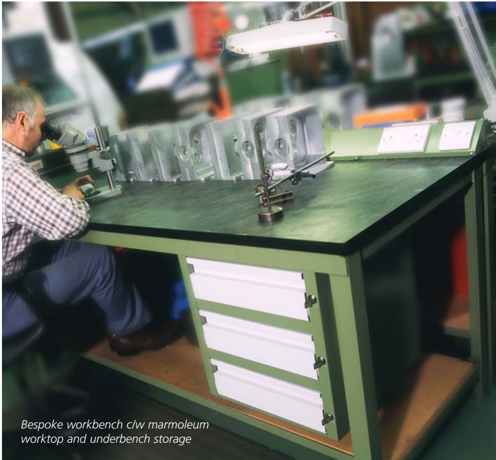
Bespoke workbench c/w marmoleum worktop and underbench storage

Bespoke Workbenches can be constructed from fabricated steel section with welded leg supports and bolt in multi-position cross rails, which can be assembled in a variety of combinations to suit individual applications.