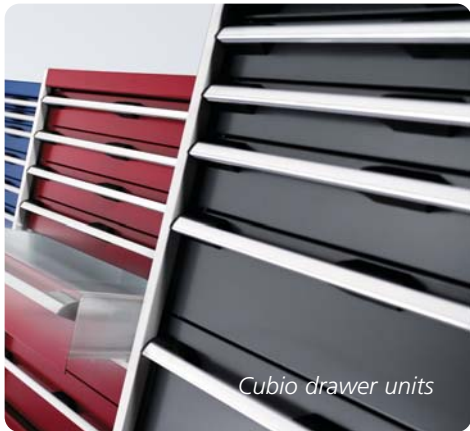
Cubio drawer units