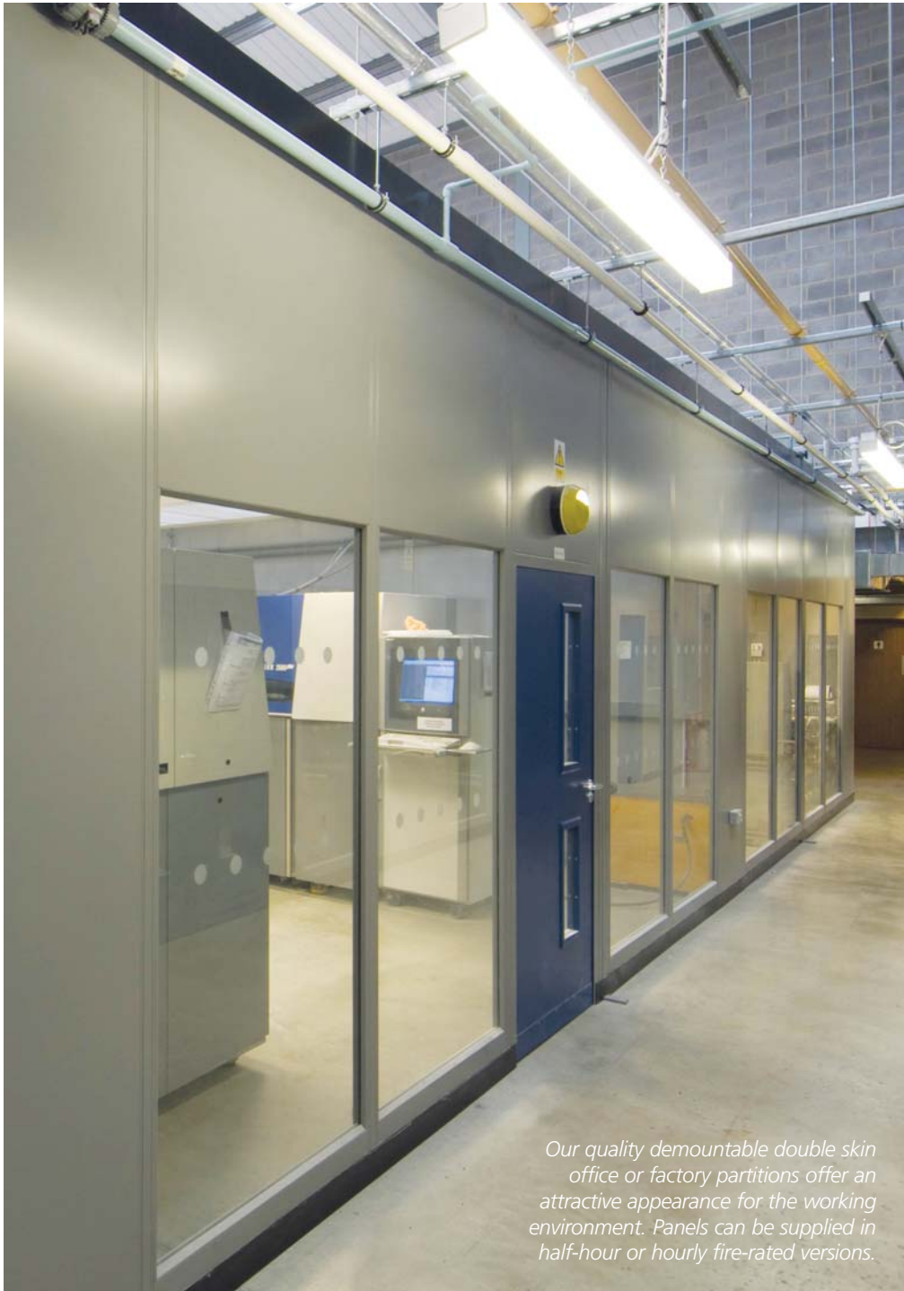
Our quality demountable double skin office or factory partitions offer an attractive appearance for the working environment. Panels can be supplied in half-hour or hourly fire-rated versions.