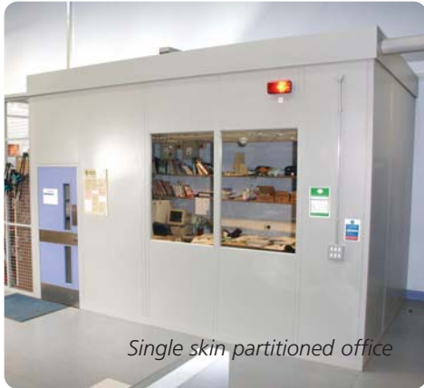
Single skin partitioned office