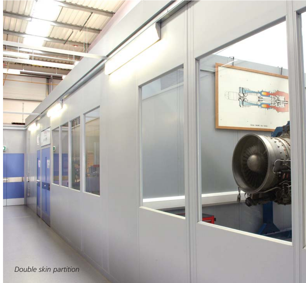
Double skin partition