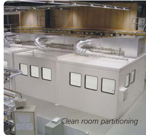
Clean room partitioning

The Avanta Clean room partitioning system is a high-quality double skin partitioning system designed for cleanroom applications, although its versatility allows it to be used in a variety of other applications where aesthetics are important. The two-line system can be used to achieve a class 5 cleanroom environment when used with the appropriate air handling and HVAC systems. Antistatic / electro dissipative and antimicrobial powder coatings are also available.