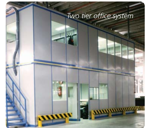
Two tier office system

Double skin partitioning is a quality four-line system that is ideal for offices and workshops in factories, warehouses and other commercial/industrial environments. It is perfect for creating a functional yet stylish working space in an industrial application, such as a manufacturing plant, where sound reduction or fire-rating might be important. This system can also be multi-tiered to make use of any height available within your facility.