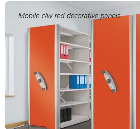
Mobile cl/w red decorative panels

As your business grows you can fit more staff into the same area making your office more productive without taking on more expensive floor space.