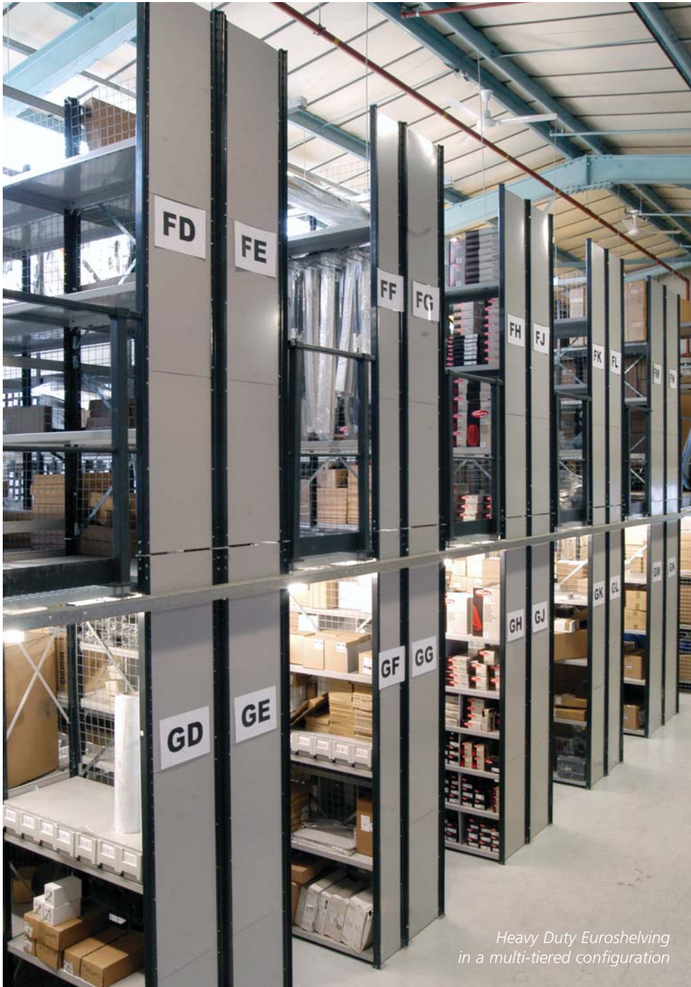
Heavy Duty Euroshelving in a multi-tiered configuration

Wherever there's a need for storage, there's a job for Euroshelving . Modular in design for ease of assembly, Euroshelving offers almost limitless scope for the creation of customised storage facilities; and a complementary range of accessories extends its capabilities still further.