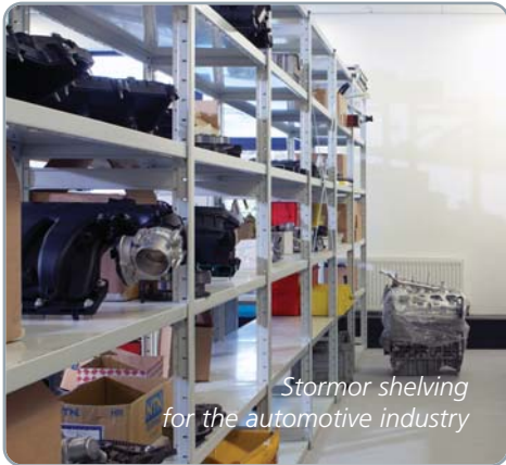
Stormor shelving for the automotive industry