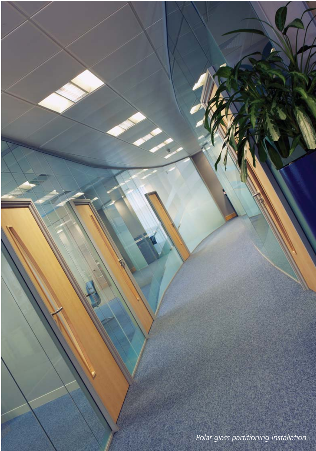
Polar glass partitioning installation