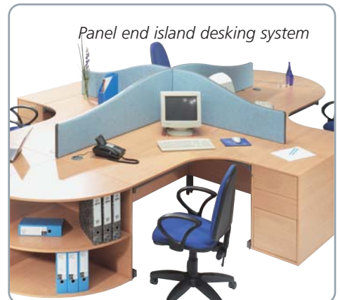
Panel end island desking system