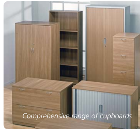
Comprehensive range of cupboards

Ingenious and versatile, KM 3 Storagewall not only provides impressive storage capabilities but it can also double as a partition