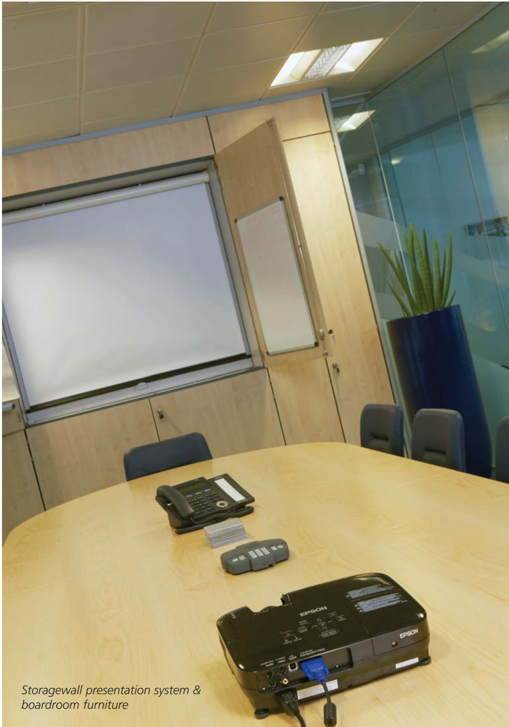
Storagewall presentation system & boardroom furniture