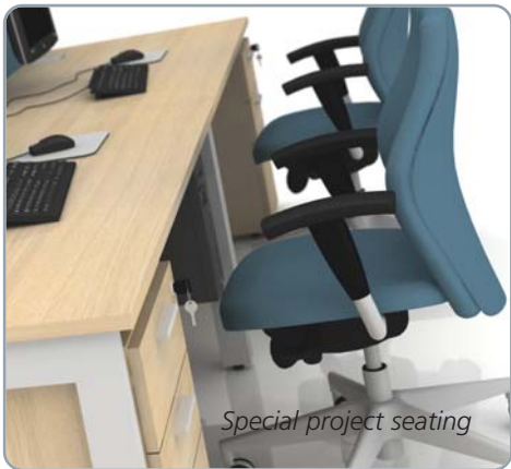
Special project seating

KM 3 Storagewall divides space, provides high volume storage and is totally flexible. Its relocatability and optimisation of floor space endorses KM 3 efficiency, cost-effectiveness and impressive storage capacity.