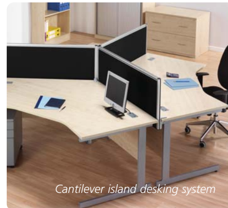
Cantilever island desking system