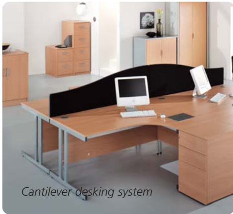
Cantilever desk system