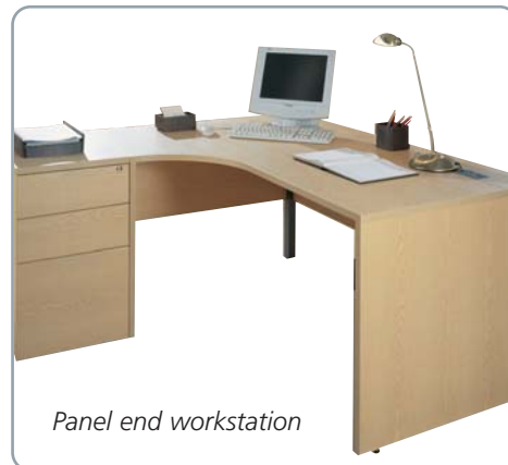
Panel end workstation