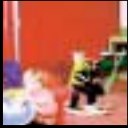
Folding Fabric Partitions