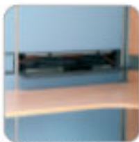
optional desk electric

HL Enhance's glass panel elements are single glazed using 6.4mm laminated glass. Glazing styles include top, part, full or Chinese (multi-panel) glazed. These options combined with bespoke graphics can produce innovative design schemes.